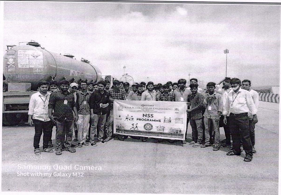
Samsung Quad Camera Shot with my Galaxy M32